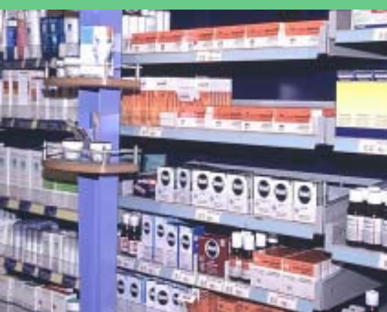
The exact amount of poisons or narcotics actually in circulation or that enter already weakened human bodies, nobody knows, but we are talking huge amounts

There is, moreover, a great need for reform in state-run schools. Children and youth are supposed to learn mathematical and chemical formulas, but they are taught not nearly enough about their own bodies.